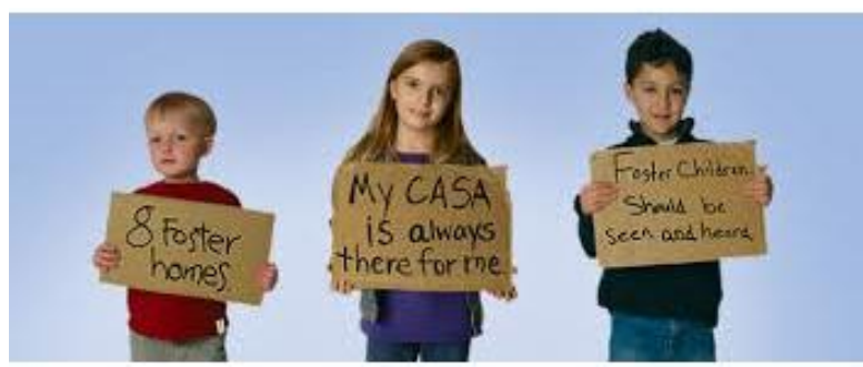
Thank you for making a difference in our lives!